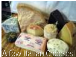
A few Italian Cheeses!

Italians are extremely proud of their culinary tradition, pizza, pasta and tomato sauce are very well known around the world but we have much more: almost every city and region has a typical dish and some towns have centuries-old traditions: just think of Risotto, pizza, parmigiana, lasagna, arancini, polenta, gelato, tiramisu, pastier, cannoli. In Italy you can find nearly 200 kinds of cheese, including the famous Parmigiano Reggiano, and 300 types of sausages.