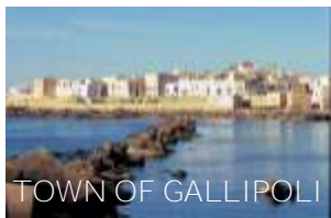
TOWN OF GALLIPOLI

If you are thirsty while sightseeing the tap water is safe to drink and in Rome they have exceptional pride in their quality of water. This goes right back to the building of aqueducts, channeling pure mountain water to all the citizens of Rome during Roman times. You can refill your drinking containers and bottles at any of the constant running taps and fountains dotted around the city, safe in the knowledge that you are getting excellent quality cool spring water.